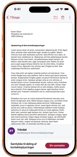
The cover letter informs the customer of the consent.

e-Boks has developed a sender-specific consent flow for both mobile and web, making it easy and intuitive for customers to give and withdraw their consent to your company.