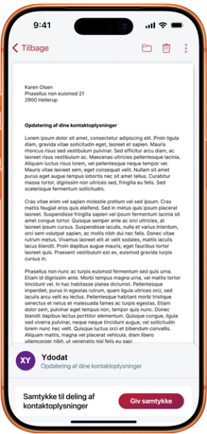
Your cover letter that informs the customer about

e-Boks has developed a sender-specific consent flow for both mobile and web, making it easy and intuitive for customers to give and withdraw their consent to your company.