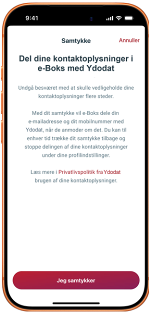
The customer gives consent to data sharing.