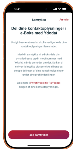
The customer approves data sharing directly in e-Boks.