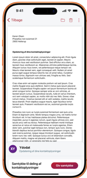
The cover letter informs the customer of the consent request.

e-Boks has developed a sender-specific consent flow for both mobile and web, making it simple and intuitive for customers to grant or withdraw consent.